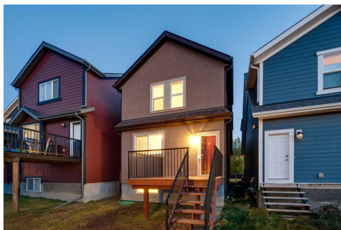
104 Masters Link SE, Calgary, AB